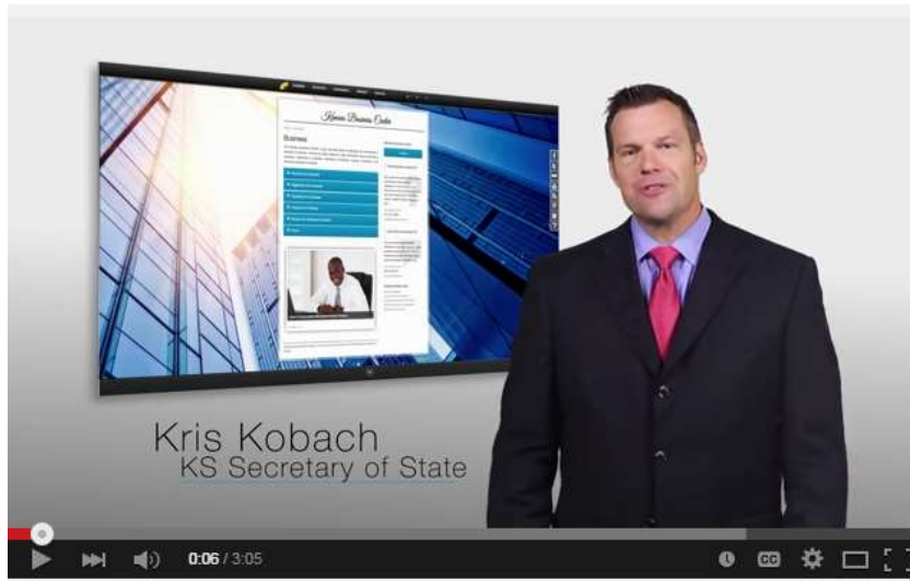
Introduction to Kansas Business Center